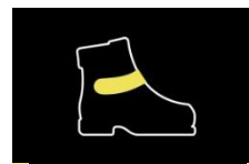
VELCRO® BRAND CLOSURE STRIP