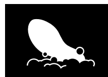
WASHABLE REMOVABLE INSOLES