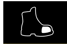
NON METALIC TOECAP