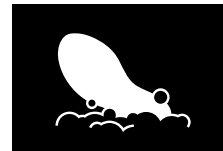
WASHABLE REMOVABLE INSOLES