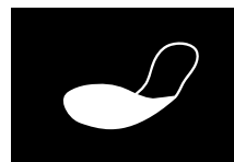
FLEXIBLE ANTI-PUNCTURE INSOLE